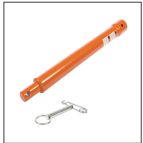
2350-15X Plain Shaft Auger Extension

All specifications are general in nature and are not intended for specific application purposes. General Equipment Company reserves the right to make changes in design, engineering, or specifications and to add improvements or discontinue manufacture at any time without notice or obligation. Consult applicable Operator Manual before utilizing. Names depicted are the registered trademarks of their respective owners. Form: GEF02012001 v1.0