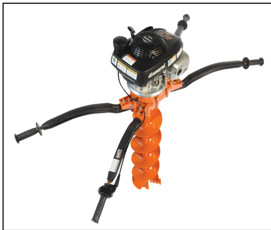
262H Hole Digger