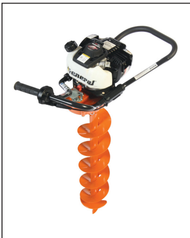
242H Hole Digger

Dimensions depicted are for reference only