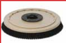
Nylon or Poly Brush