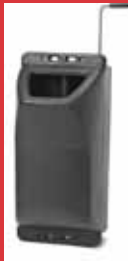
4-Gallon Tank Available in 9 Different Colors

Optional splash guard available in all sizes.