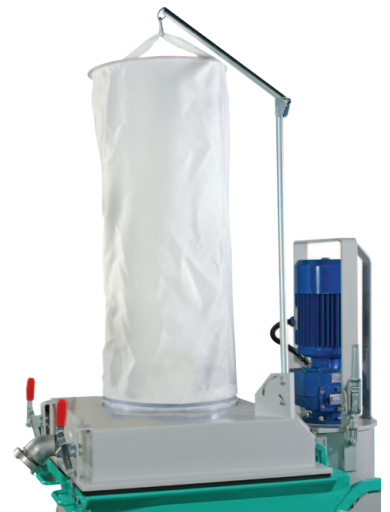
Blower hood (Opzional)