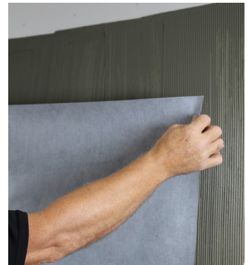
Method 3 (ARDEX TLT™ Waterproofing Membrane)