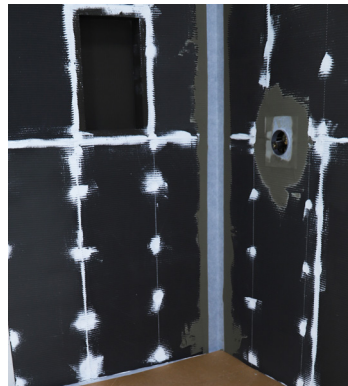
Method 2 (ARDEX CA 20 P™)