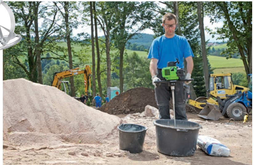
Ideal for medium- to high-viscosity powder and liquid materials