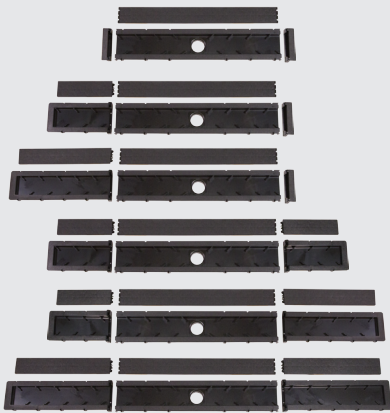
Six Disassembled Main Drain Configurations