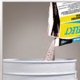
Add base powder