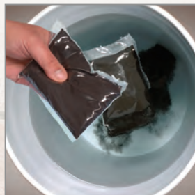
Drop packs into water