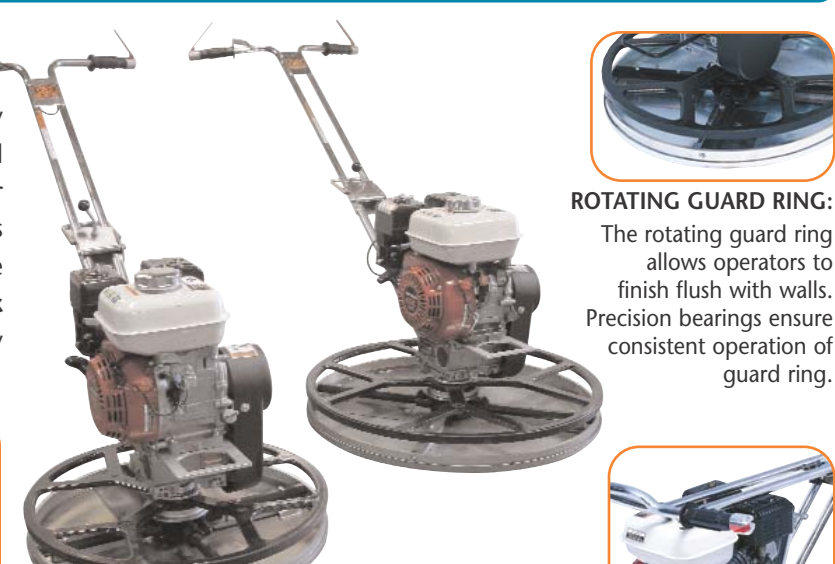
FOLD DOWN HANDLE:

( ) Metric Measurements Specifications subject to change without notice