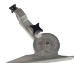
ANGLE GUIDE #V370060