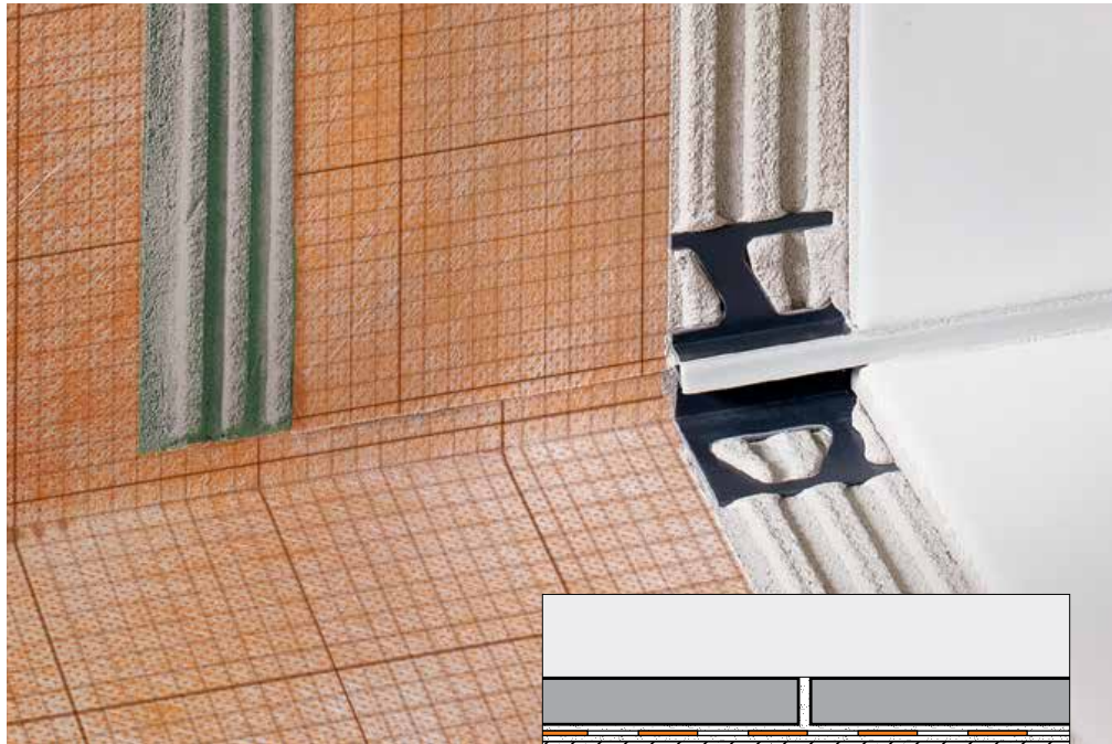
8.1 Schluter®-KERDI 8.1 Schluter®-KERDI-DS

Preformed, seamless corners include the following. KERDI-KERECK-F are used to seal 90° inside and outside corners. KERDI-